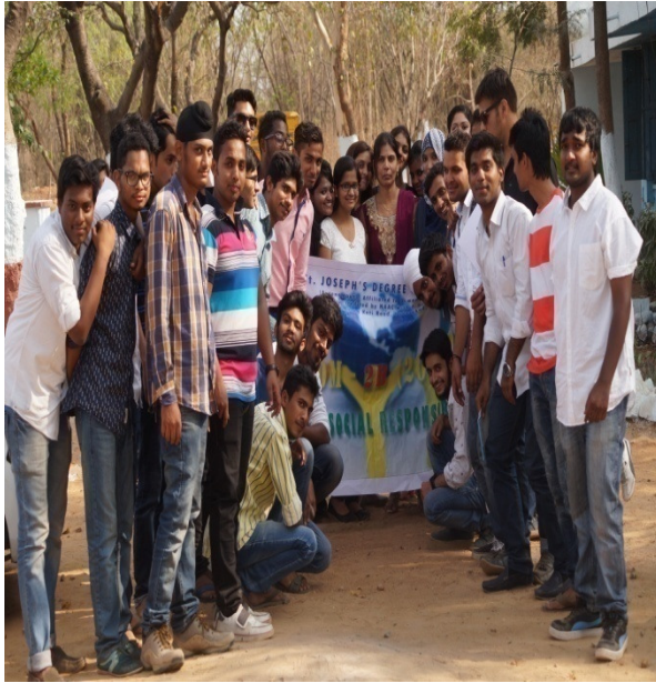
Visit to Devnar School for the Blind