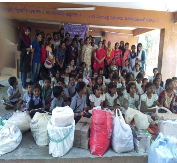
Visit to Gracious Paradise Charitable foundation Visit to Sannihita Centre for Women & girl child